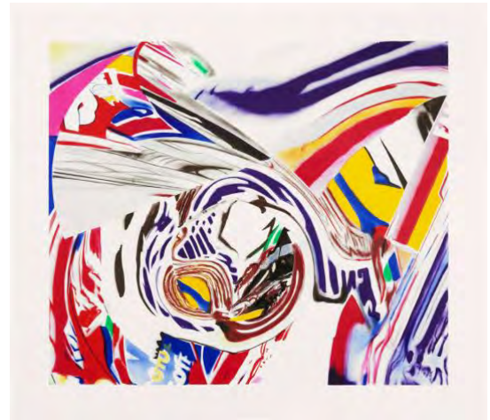
James Rosenquist, After Berlin V , 1999. 10 color lithograph, 32-3/4 x 37-1/8 inches. Edition: 80; XXX.

The sale begins at 10 am with only a few impressions of each artwork available at the discounted price. All sales benefit