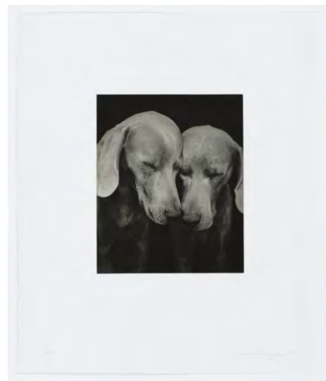
William Wegman, Reflectional , 2002. Photogravure, 26-1/4 x 22-1/2 inches. Edition: 20; XLV.